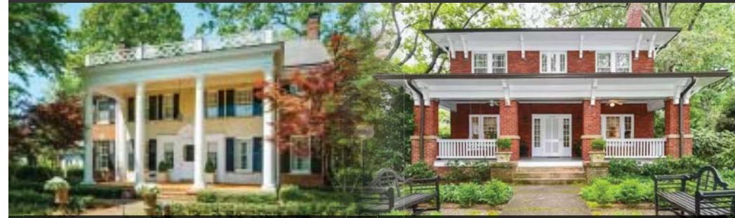
● 2011 Granville Rd, Greensboro, NC 27408