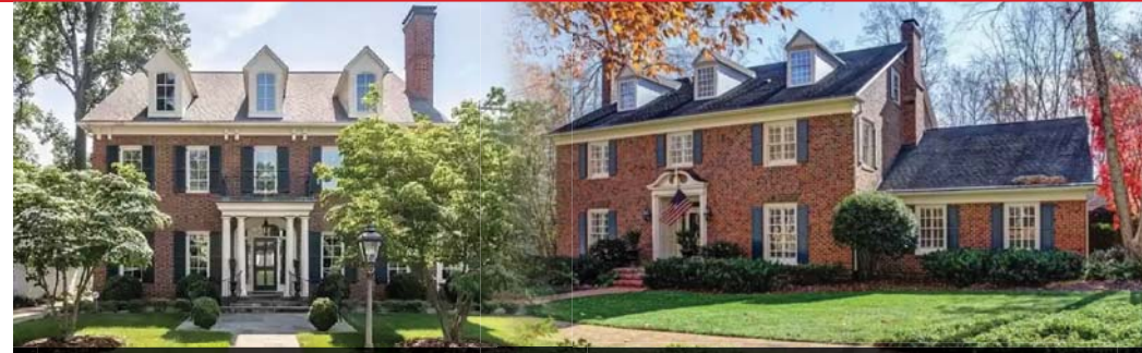
● 1604 Birch Ln, Greensboro, NC 27408

The Greensboro Urban Loop (I-840) is nearing completion and will soon completely encircle the city of Greensboro. The final portion of the Urban Loop will connect N. Elm St to US-29 in North Greensboro just over 0.4 miles from the Subject Property. The available ± 0.91 ac outparcel and 1,400 SF space are situated on the northern boundary of the upscale 'New Irving Park' neighborhood with Average Home Values in excess of $428,000.